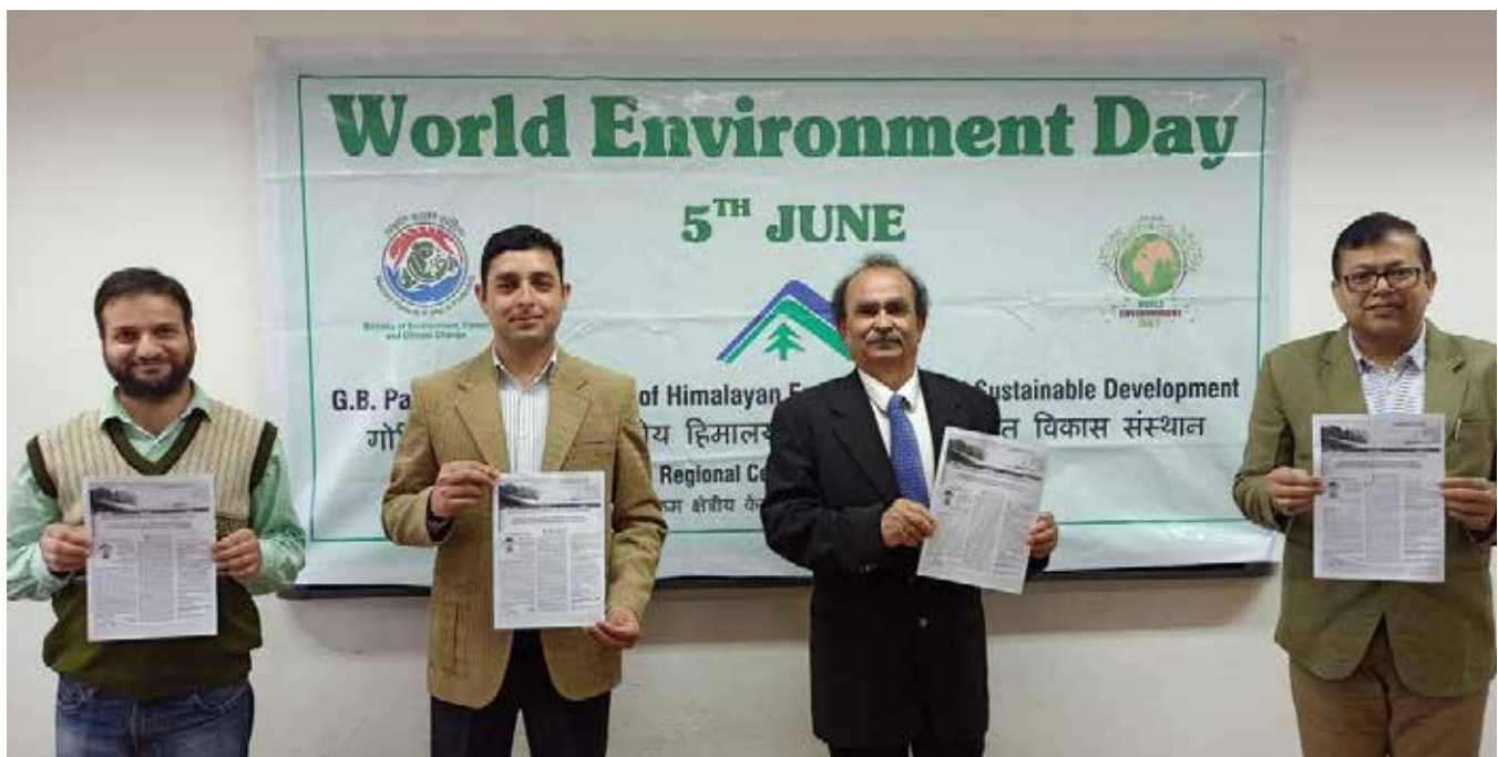
Release of News Letter