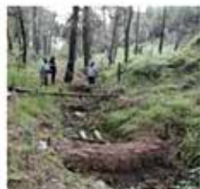
Pine needle check dam