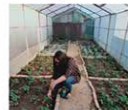
Cash crop production