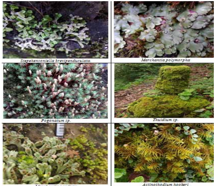
Fig. 3. Bryophytes of Chopta-Tungnath timberline zone, Garhwal Himalaya

Diversity of Bryophytes: Across the six sites a total of 51 species of Bryophytes, including 17 liverworts, 2 hornworts and 32 moss were recorded in the field (Table 4). Maximum species (43 species) were recorded along the Kachulakharak site that presented congenial landscape for the spread of bryophytes species and communities. 20 species ( Atrichum sp, Bryum sp, Dicranum sp, Entodon sp, Funaria sp, Herpetineuron sp, Mnium sp, Plagiothecium sp, Pogonatum sp, Thuidium sp, Anomodon sp, Chiloscyphus sp, Frullania sp, Heteroscyphus sp, Plagiochilla sp, Scapania sp, Pellia sp, Cyathodium sp, Conocephalum conicum , Marchantia polymorpha were found common almost in all the study sites. Bryotaxa restricted to higher elevation sites were species of mosses viz., Actinothuidium , Bryum , Rhacomitrium , Grimmia , Pogonatum and hepatic like Sauchia , Scapania , Bazzania , Plagiochilla and Herbertus spp. Some photographs