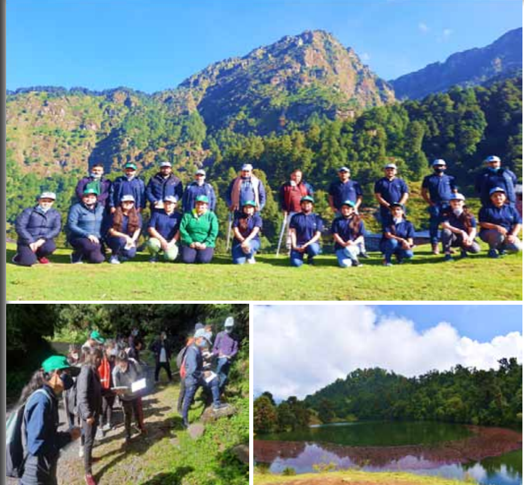
Vegetation Assessment, Collection and Documentation of Foristic Elements (Higher and Lower Floral Groups)- Brief Report of a Field Workshop

The Himalaya is warming 2-5 times more than global average rate and the degree of temperature rise increases with altitude leading to glacier shrinkage and upward movement of many species and communities. Shift of timberline is mainly reported. Generally, timberline defined as the high-altitude limit of forests is highly sensitive zone to temperature change and often considered as an indicator of climate change. The importance of timberline, apart from being climate change indicator, is realized as provider of ecosystem services, such as medicinal plants, grazing site for migratory livestock, snow melt water fed springs and religious and adventure tourism. More importantly it harbours many unique assemblages of plants and animals. Therefore, timberline needs to be investigated thoroughly for the identification of effective indicators of climate change and to know the distribution range of timberline over the Himalaya region.