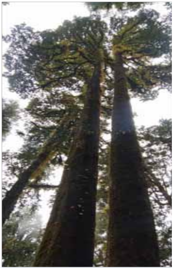
Quercus semecarpifolia mature trees at Tungnath timbrline

ISSN : 0971-7447 (Print); ISSN : 2455-6815 (Online), Annual; Open Access; 27 Volumes More Information & Archive http://gbpihedenvis.nic.in/Envis_bulletin.html