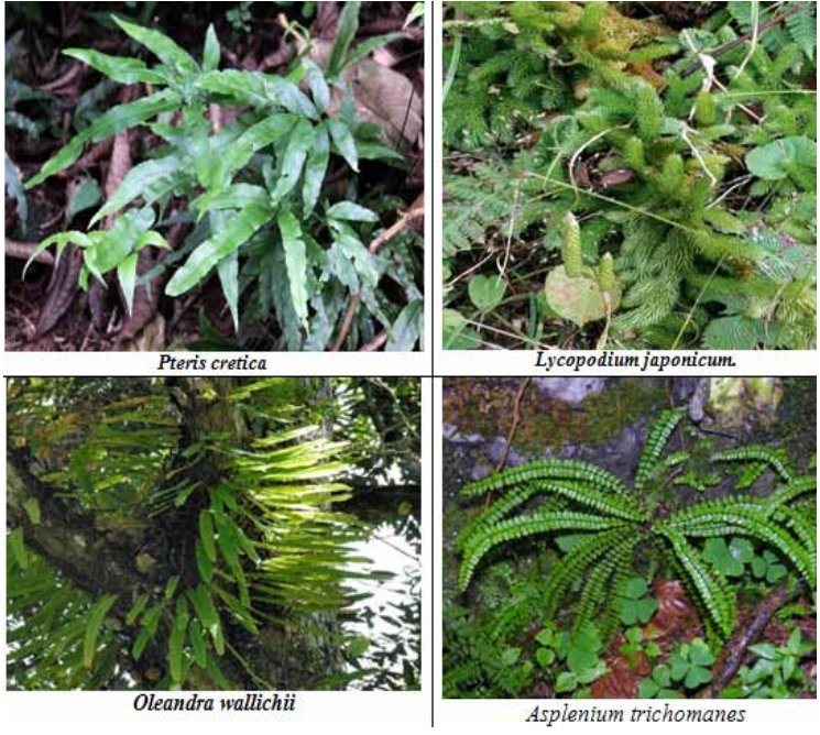
Fig. 1. Pteridophyte species of Chopta- Tungnath timberline zone

Diversity of Pteridophytes : Across the six sites, a total of 54 species of Pteridophytes were recorded and the species richness varied from 9-25 among these sites (Table 2). The maximum species richness (25) was found in Site I (Mandal) and minimum (9) at Site II (Kachulakharak). Selaginella chrysocaulos was the only species that occurred in all sites, however Dryopteris panda, Oleandra wallichii, Lycopodium japonicum, Diplazium maximum, Aleuritopteris leptolepis, Araiostegia beddomei, Athyrium atkinsonii, Dryopteris khullarii, Drynaria mollis, Pichisermollia quasidivaricata, Pichisermollia stewartii, Polystichum nepalense were present only at higher elevation sites (Dhotidhar/ Chopta). Among all the species Dryopteris chrysocoma and Dryopteris juxtaposita were present in five sites across the studied transects. Some of the prominent Pteridophytes are given in Fig. 1.